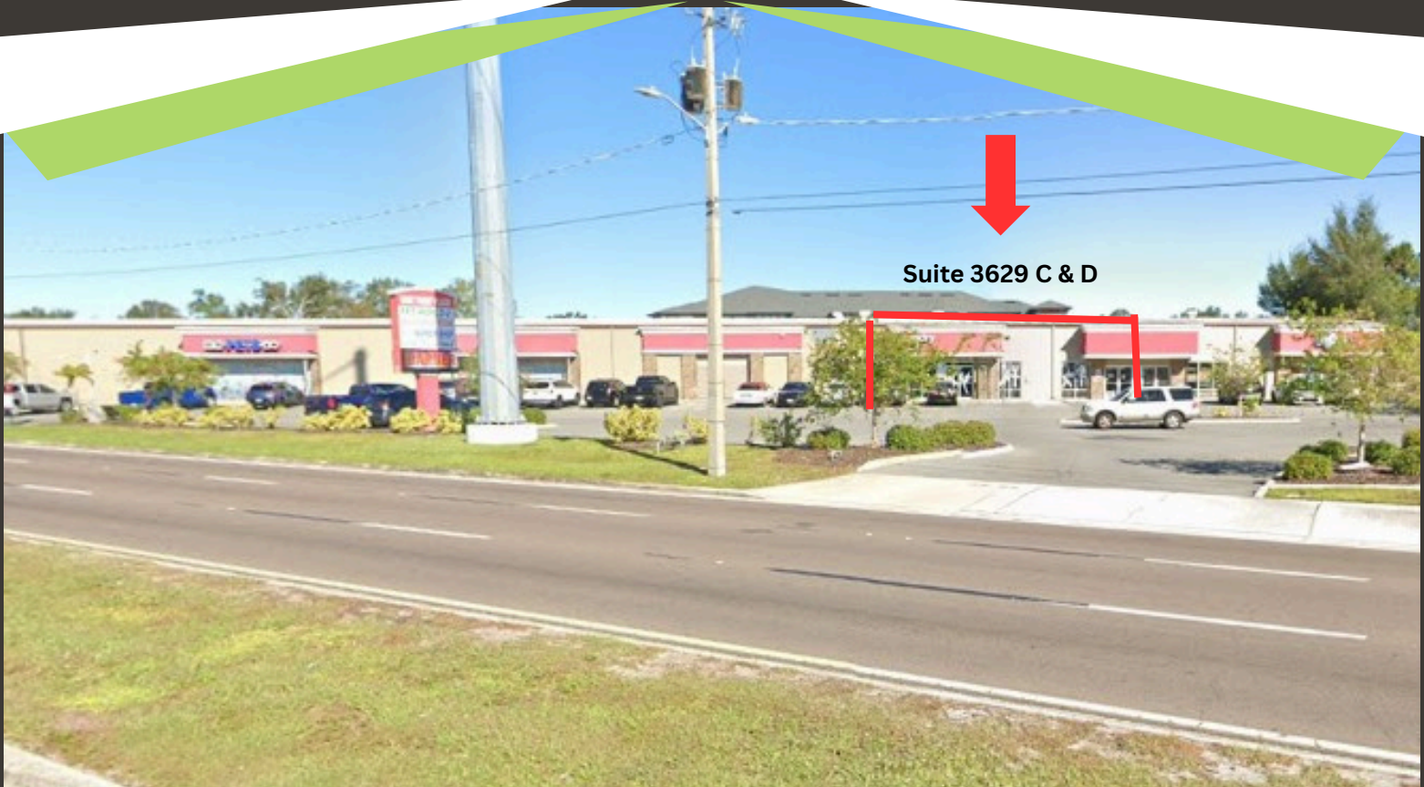
Suite 3629 C & D