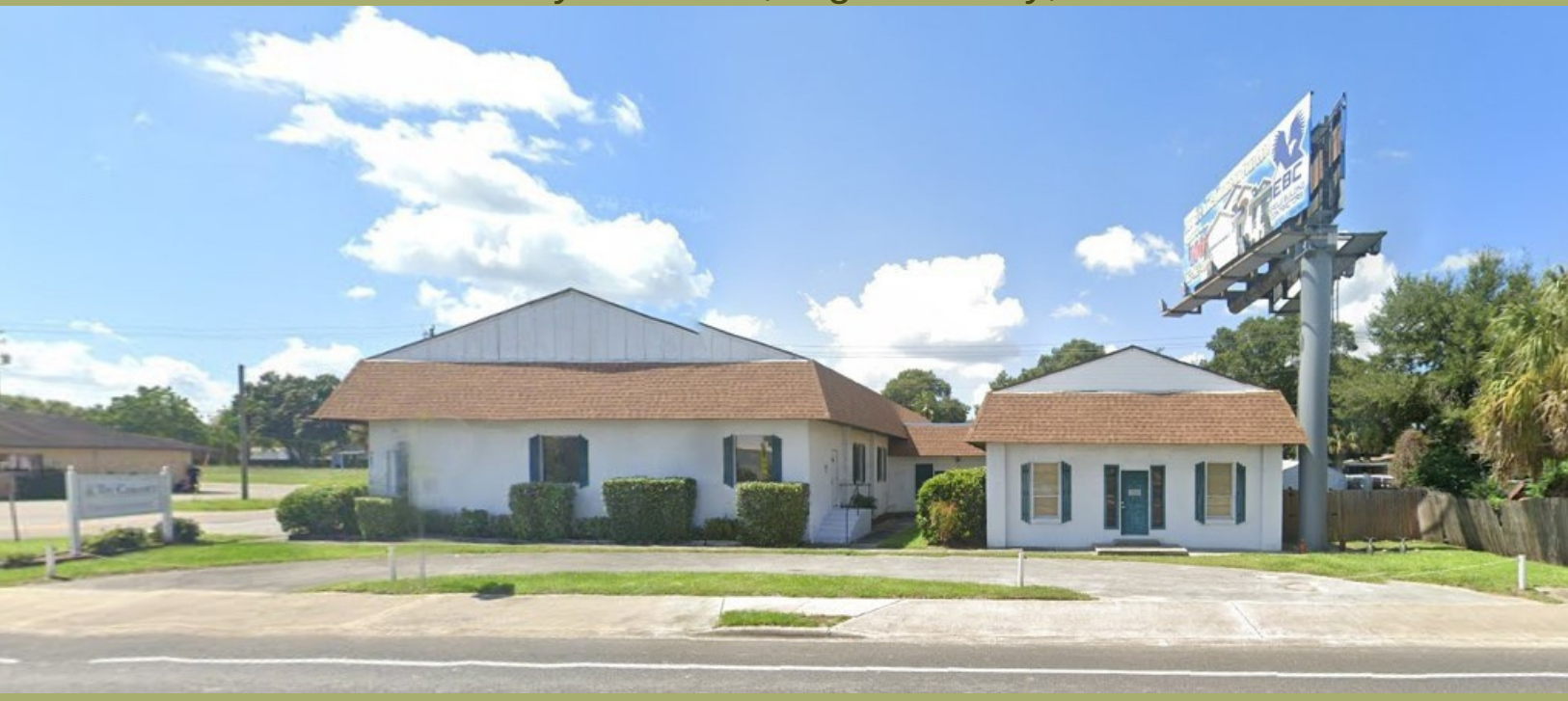
5421 US Hwy 98 South, Highland City, Florida 33846