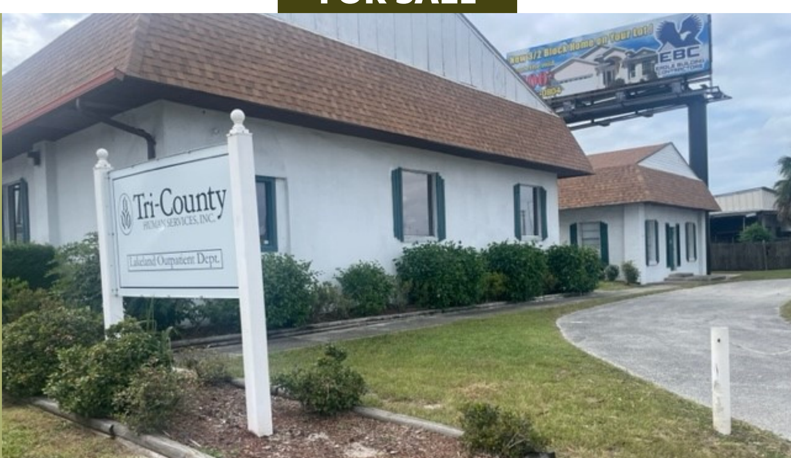
5421 US Hwy 98 South, Highland City, Florida 33846